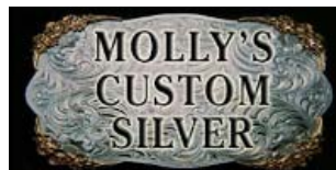
Buckle Series Ride

1 Bag Purina Horse feed, Halter and leadrope, Brushy Creek Shirt,